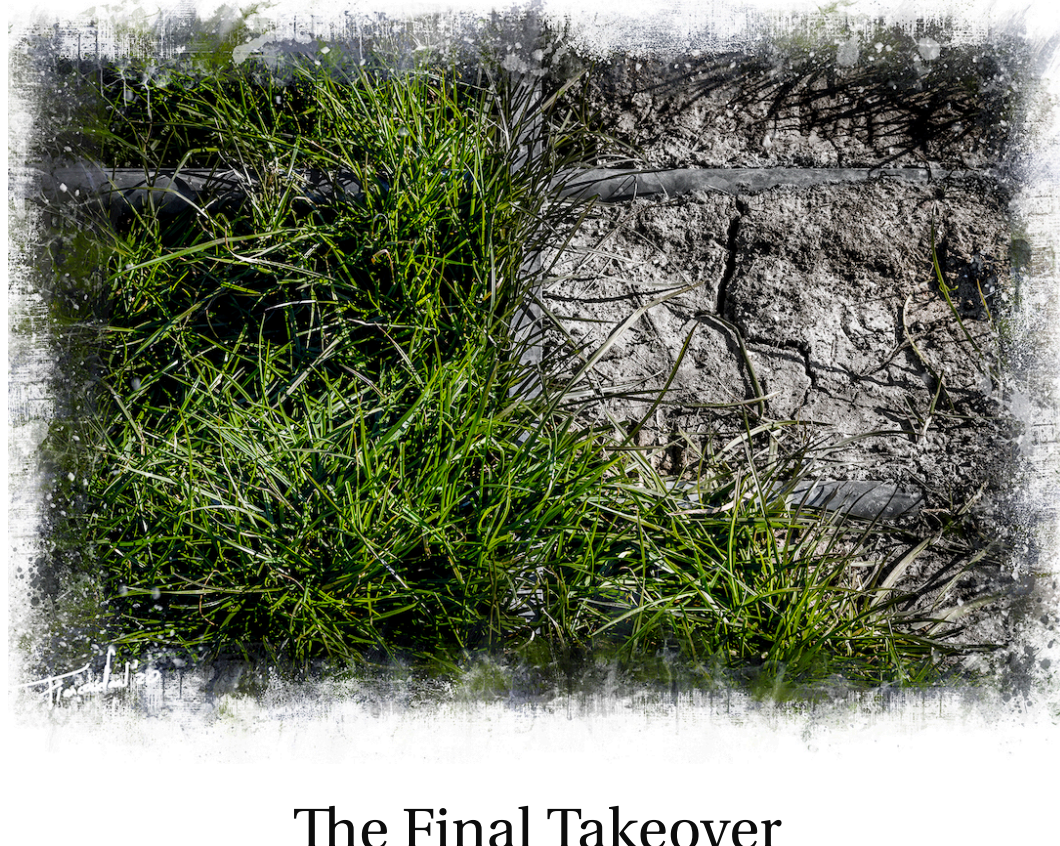
The Final Takeover